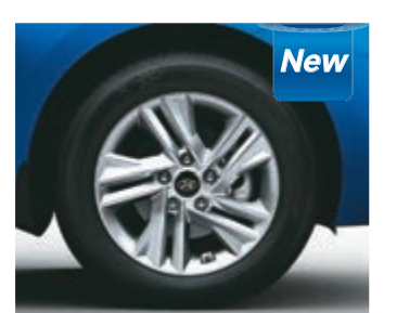
Stylish R16 Alloy Wheels