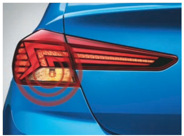
Emergency Stop Signal