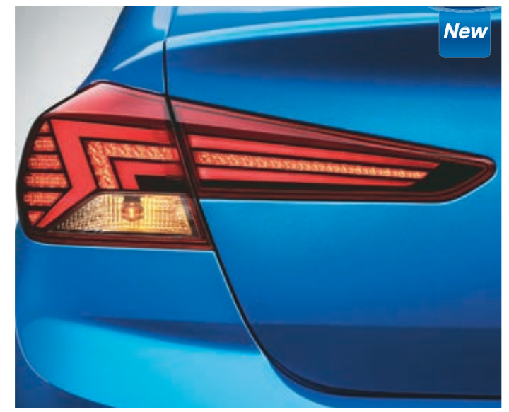
Sporty Rear Combination LED Tail Lamps