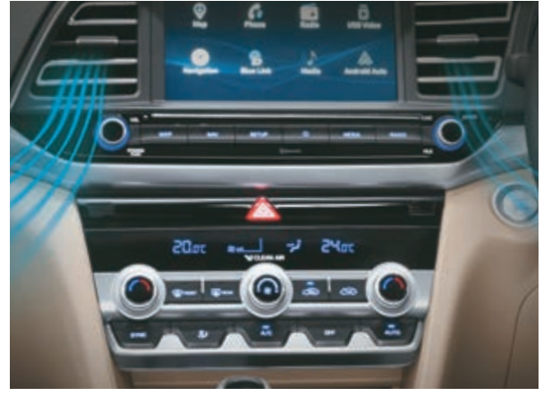
Dual Zone FATC with Cluster Ionizer