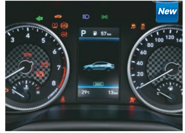
Instrument Cluster with Colored Multi Information Display

Sporty Aluminium Pedals | Driver-centric Ergonomic Design | Rear Centre Armrest with cup holder | Rear Defogger Premium Aluminium Scuff Plates | Sliding Front Centre Armest with Storage