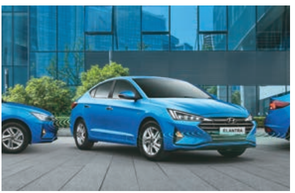
Front & Rear Parking Sensors with Rear Camera

Tyre Pressure Monitoring System (TPMS) with display on MID