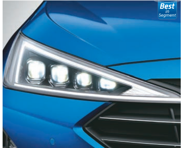
Dynamic LED Quad Projector Headlamps with LED DRLs

Shark Fin Antenna | New Front Bumper Design