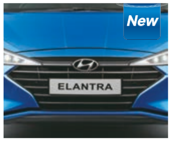
Dominant Front Grille Design