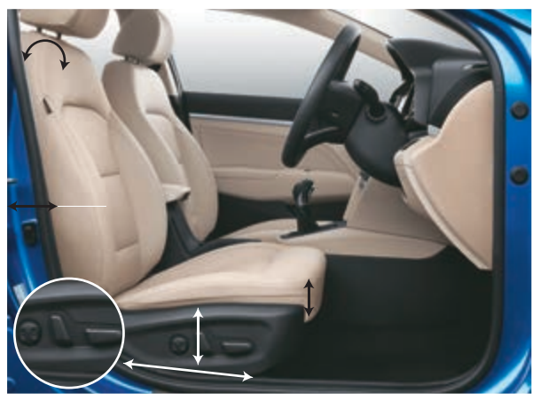
10 Way Adjustable Power Driver Seat with Electric Lumbar Support