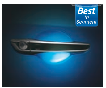
Chrome Door Handles with Pocket Light Sporty Two Tone Rear Bumper