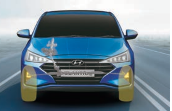
Vehicle Stability Management