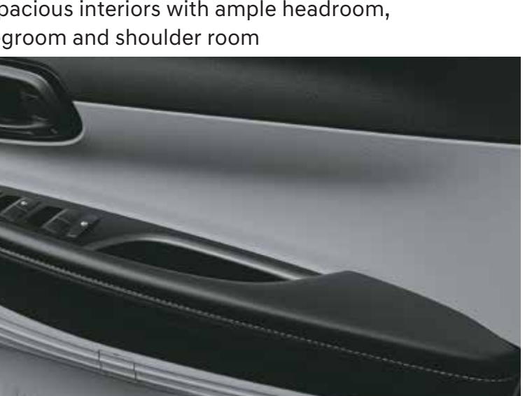
Door armrest covering (artificial leather)