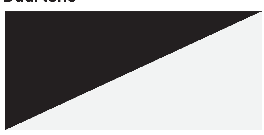
Atlas white with abyss black roof