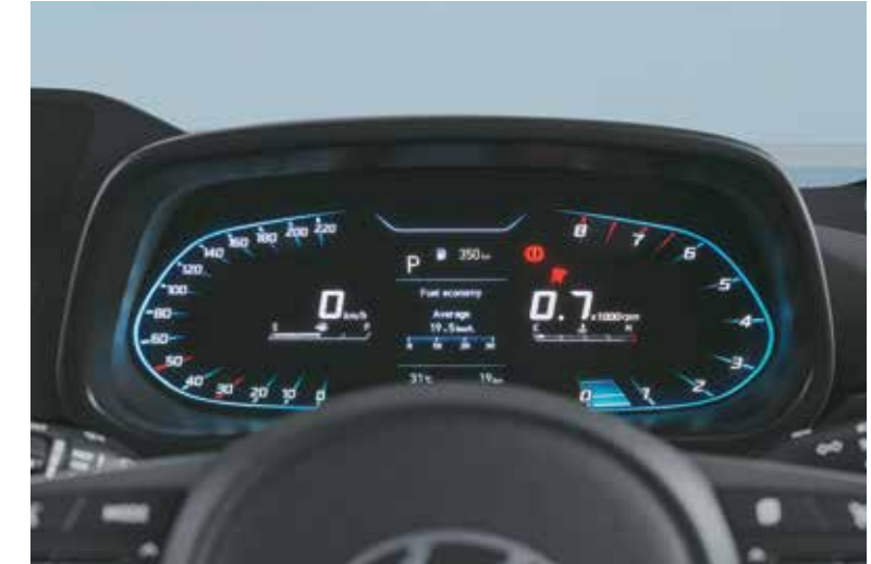
Digital cluster with TFT multi information display