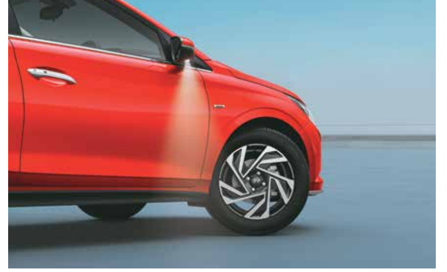
Puddle lamps with welcome function

Other features: Chrome outside door handles | Turn indicators on outside mirrors | Painted black finish side sill garnish with i20 branding Shark fin antenna