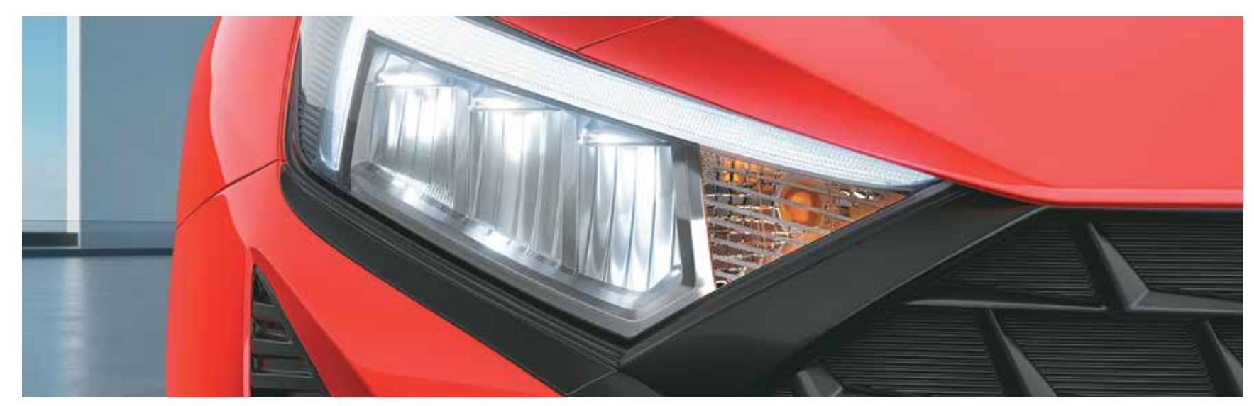
LED headlamps with signature DRLs

Hyundai i20 has it all. A sensuous sporty design, a majestic new grille and lights that are a showstopper. Turn heads as you whizz by on those alloy wheels and make an impression with the chrome lines. It's simply stunning from tip to toe.