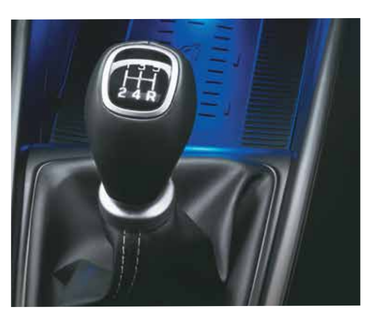
5 speed manual transmission