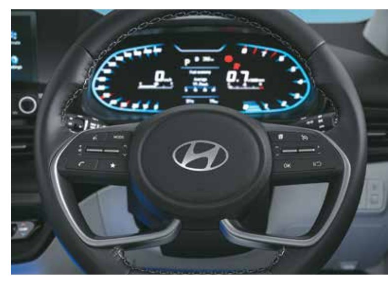
Leather wrapped D-cut steering