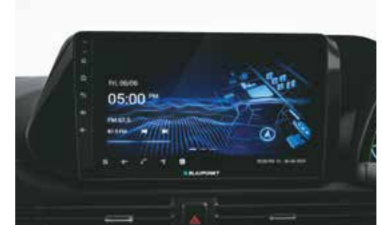
25.55 cm (10.1") infotainment system* Wireless charger