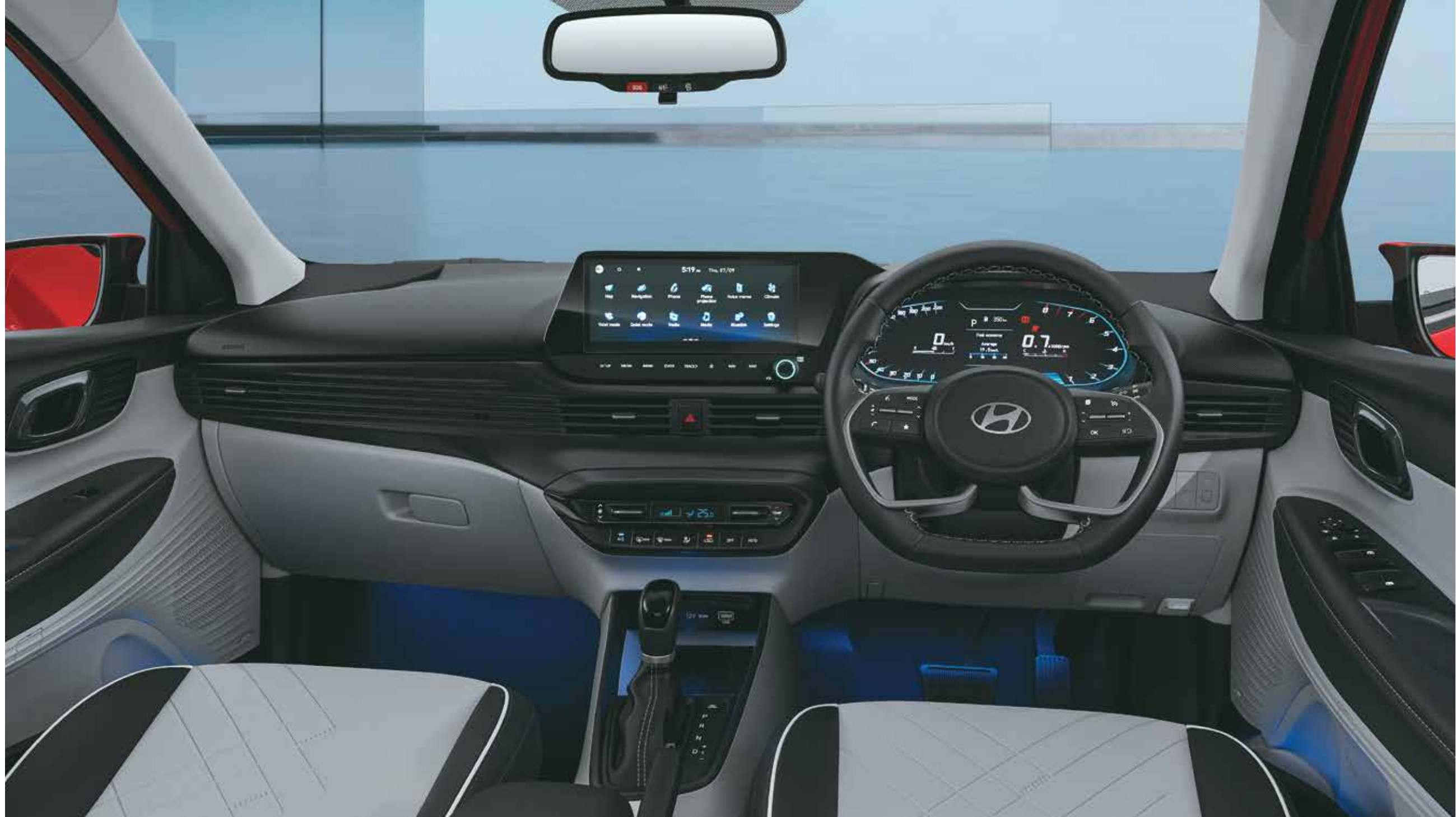
Dual tone black & grey interiors