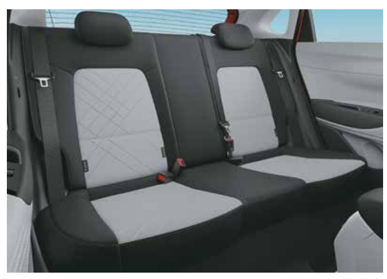
Spacious interiors with ample headroom, legroom and shoulder room