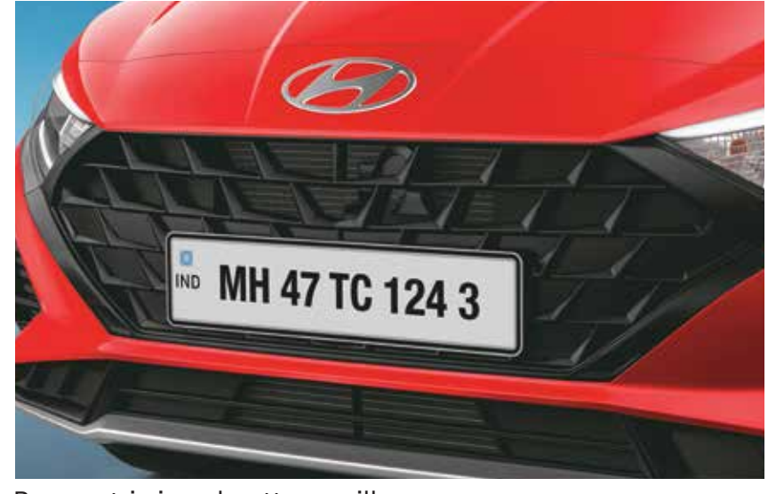
Parametric jewel pattern grille