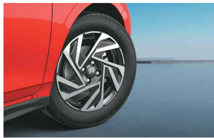
R16 (D=405.6 mm) diamond cut alloy wheels