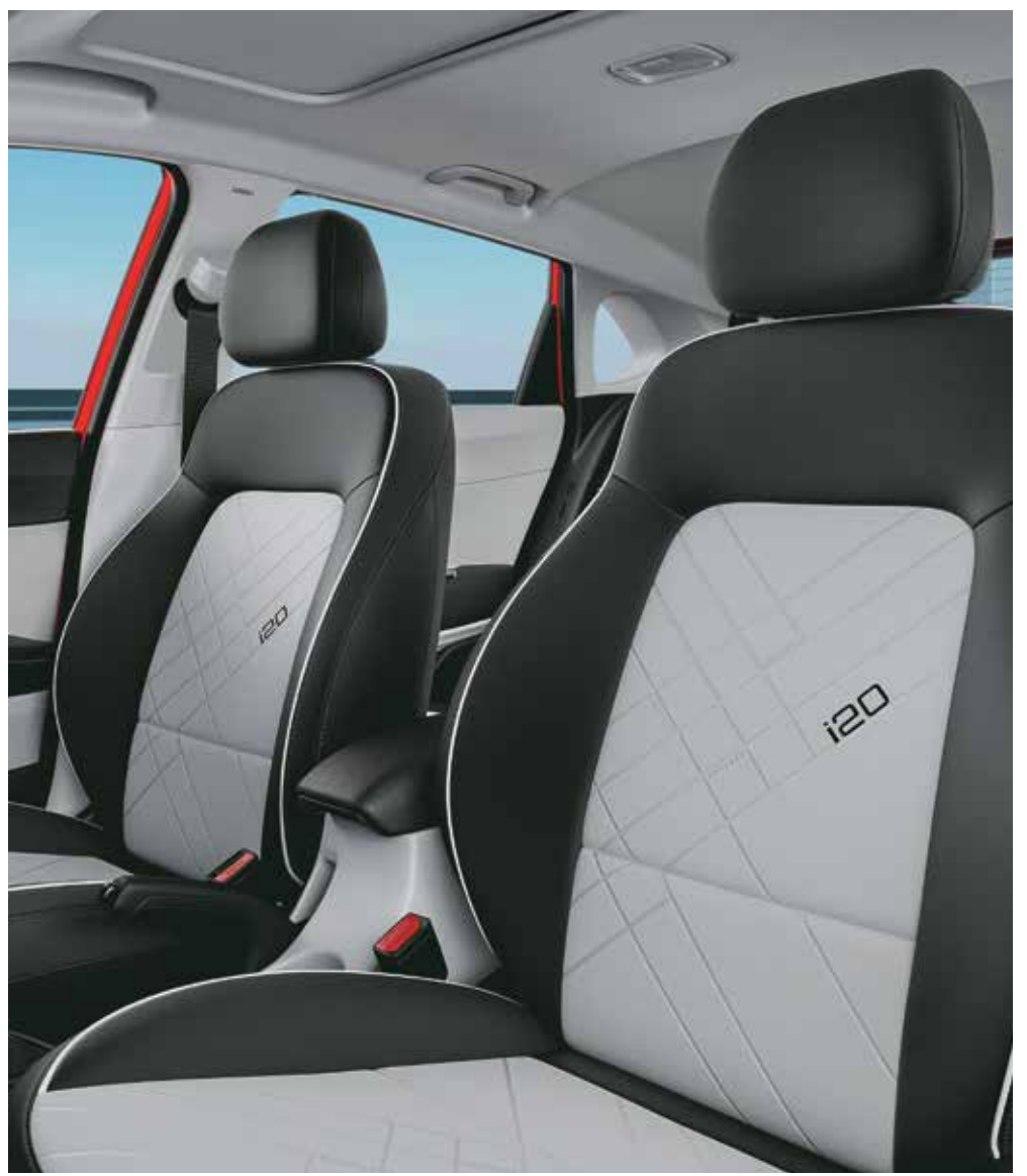
Dual tone seats with i20 branding

The interiors of Hyundai i20 mesmerize. Dual tone seats that look fabulous and enough space to lounge out in comfort. Ambient lighting that uplifts your mood and sliding front armrest that provides a more convenient way to relax.