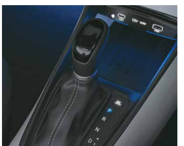
Intelligent variable transmission (IVT)