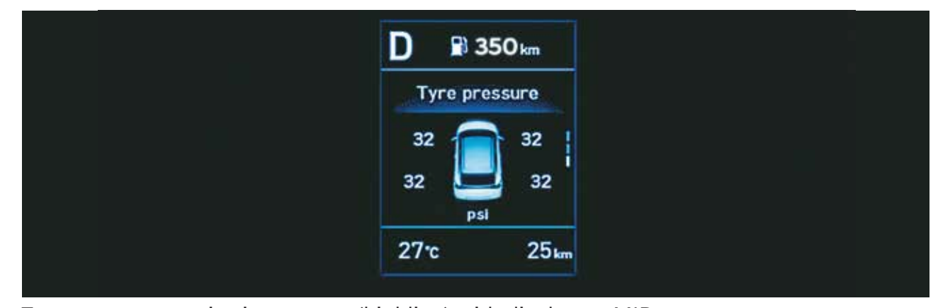
Tyre pressure monitoring system (highline) with display on MID

Hyundai i20 ensures you drive safe wherever you go. It comes equipped with advanced safety features that are a cut above the rest. 6 airbags for maximum protection. Electronic stability control (ESC) with vehicle stability management (VSM) and emergency stop signal (ESS) ensure that you always drive stress free.